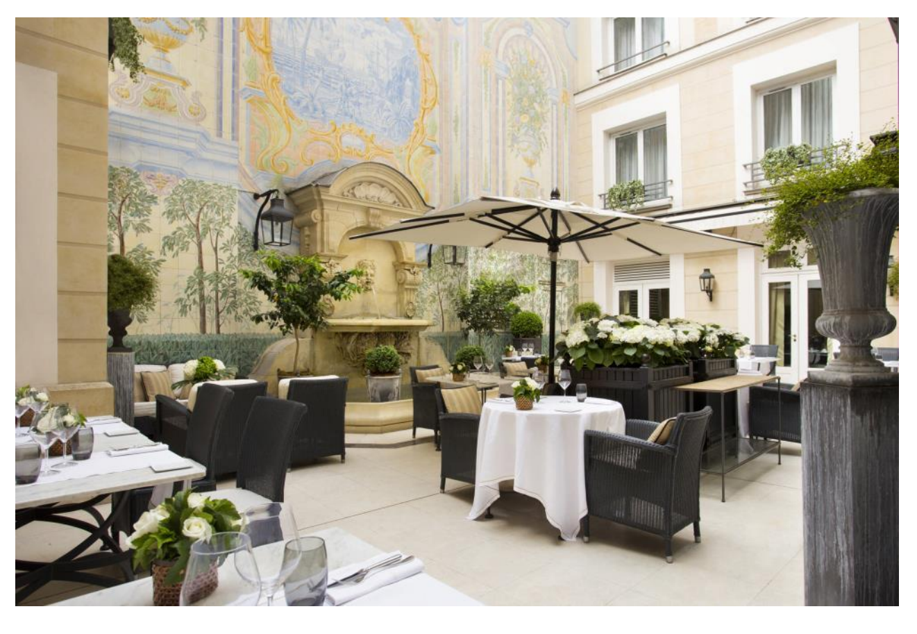
L'Assaggio Bar & Salon de Thé

L'Assaggio restaurant is open every day from Tuesday to Saturday for lunch and dinner, from 12:00 pm to 2:30 pm and from 7:30 pm to 10:30 pm. Closed on Sunday and Monday. August closed.